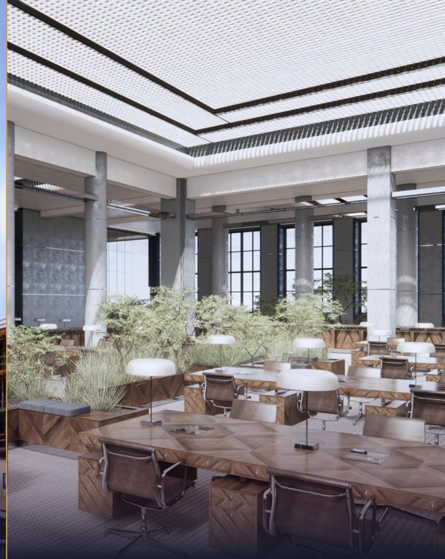
NATIONAL BANK Gdansk