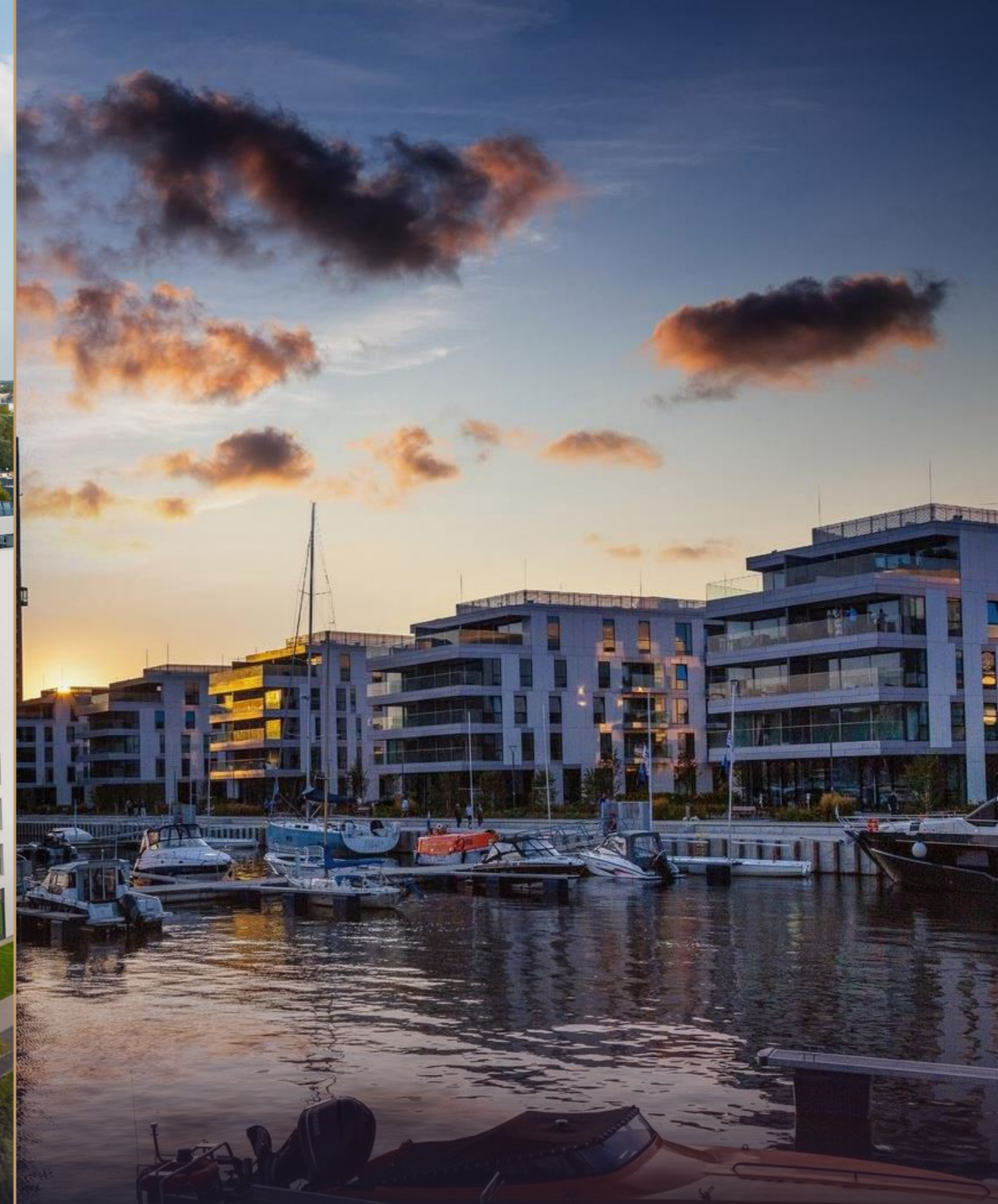
YACHT PARK Gdynia