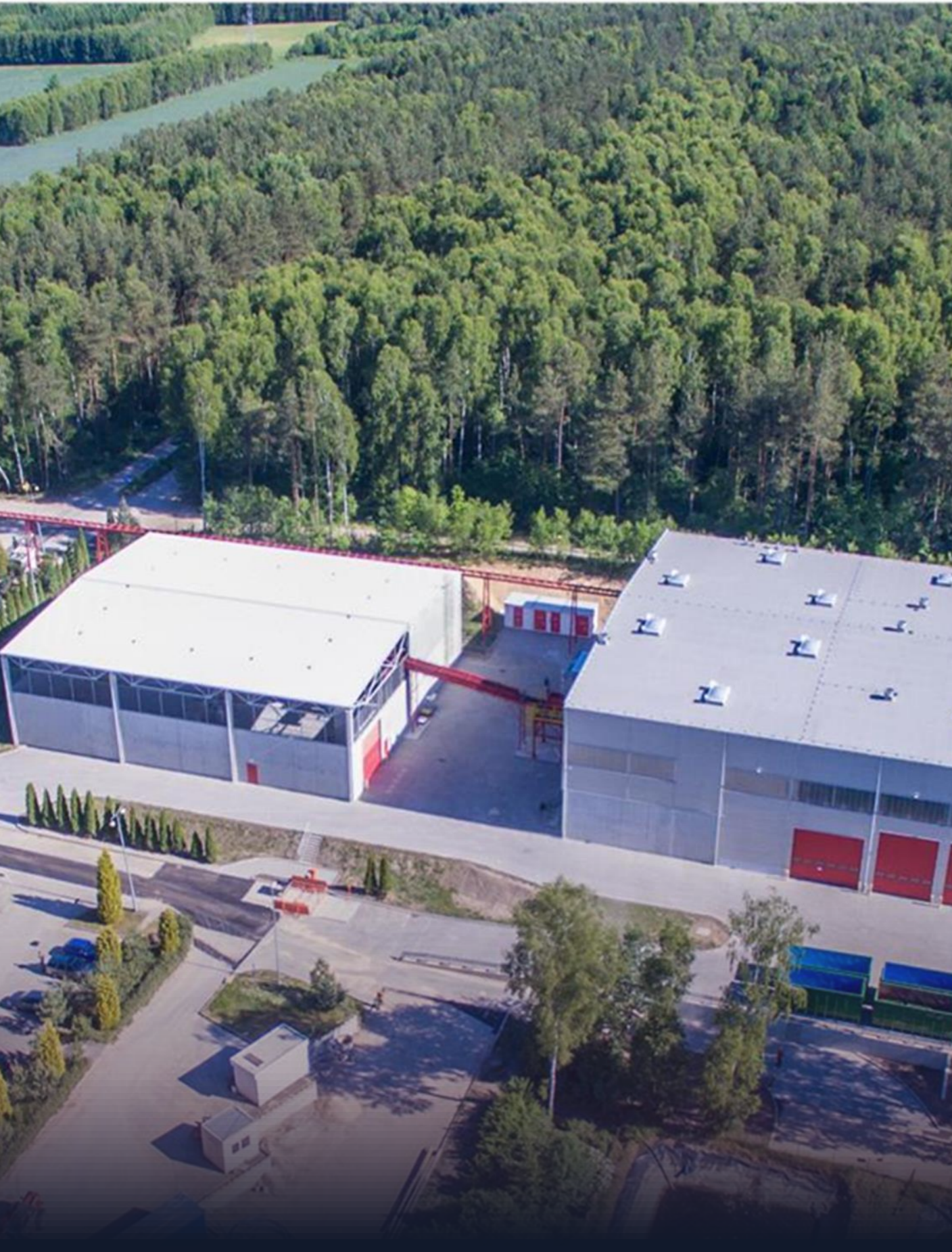
WASTE TREATMENT PLANT Ruszczyń