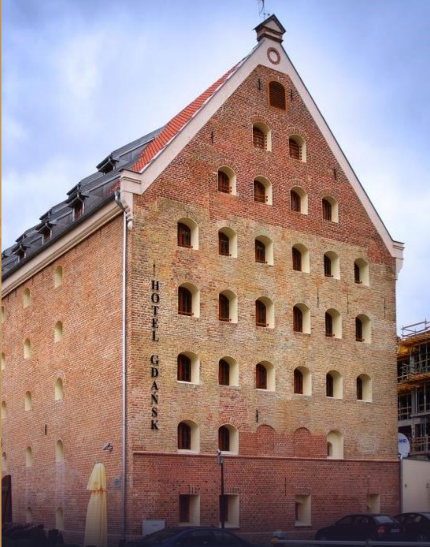
Hotel Gdansk Gdansk