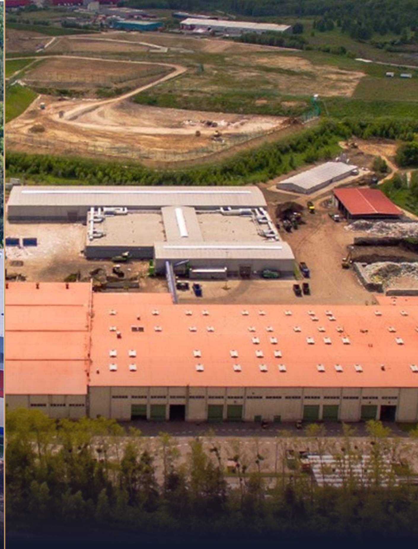
WASTE UTILIZATION PLANT Gdansk