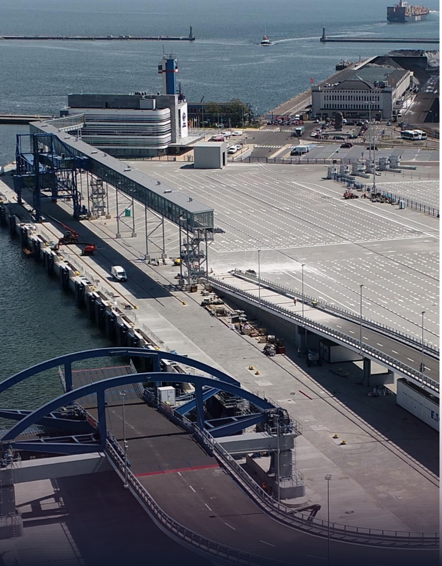
PUBLIC FERRY TERMINAL Gdynia