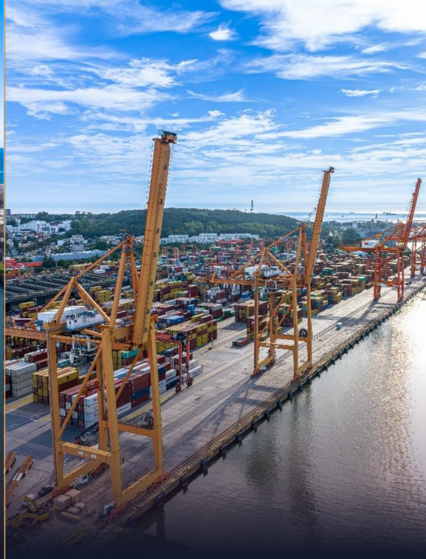
PORT GDYNIA Gdynia