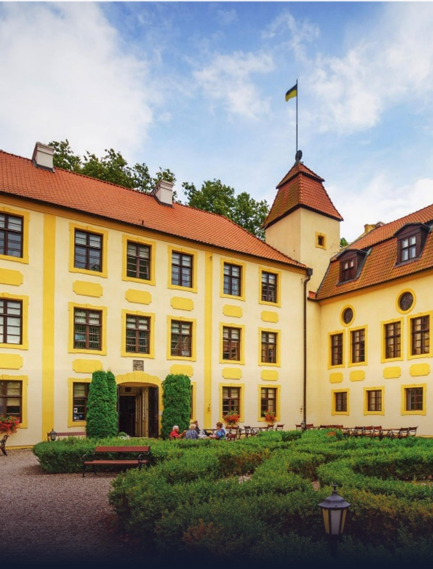
PARK AND PALACE COMPLEX Krakowa