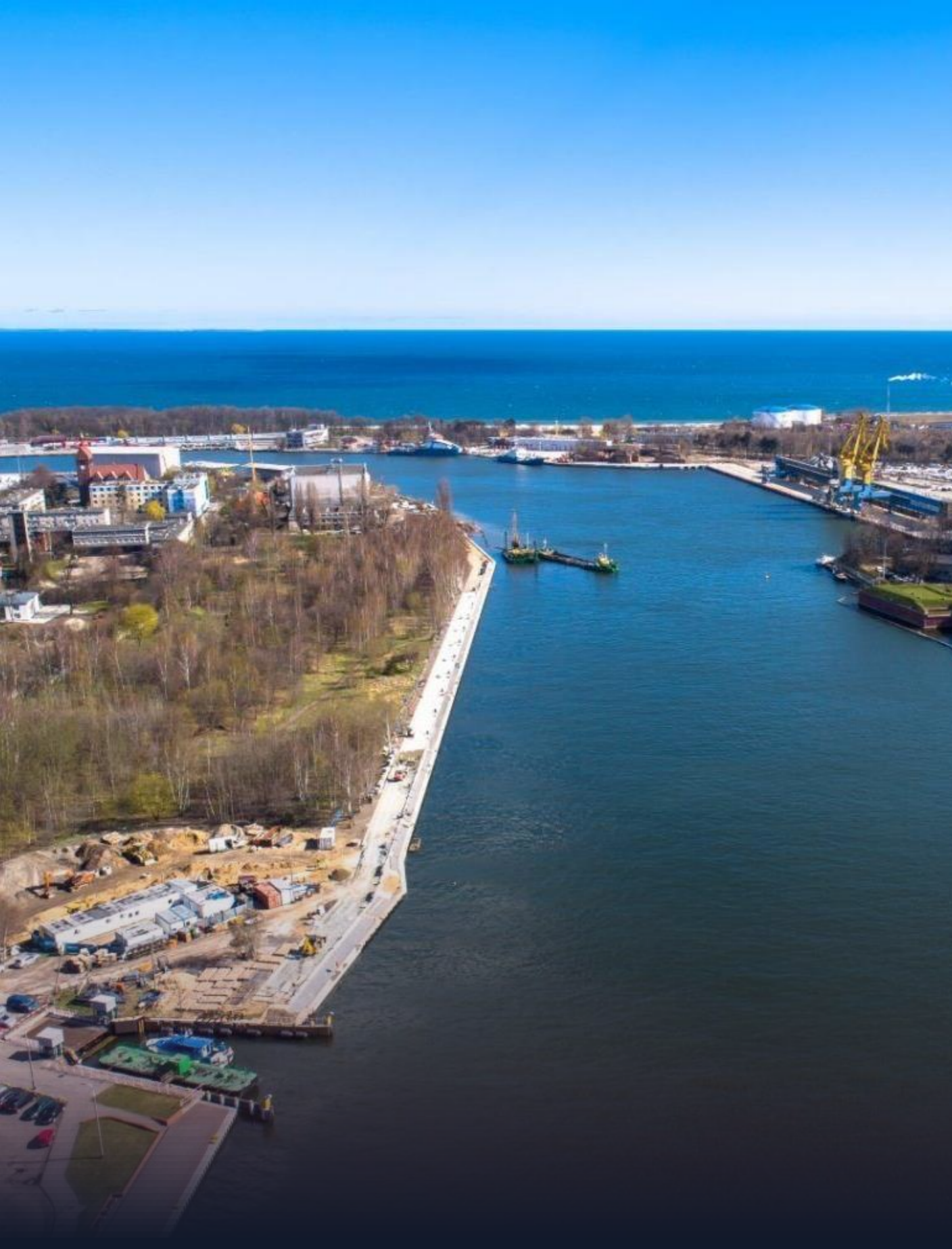
PORT GDANSK Gdańsk