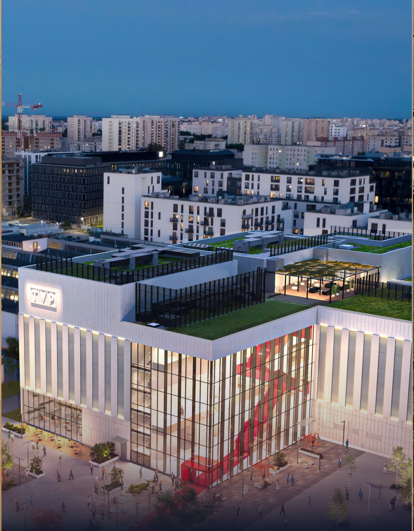
MOTION PICTURES STUDIO Warsaw