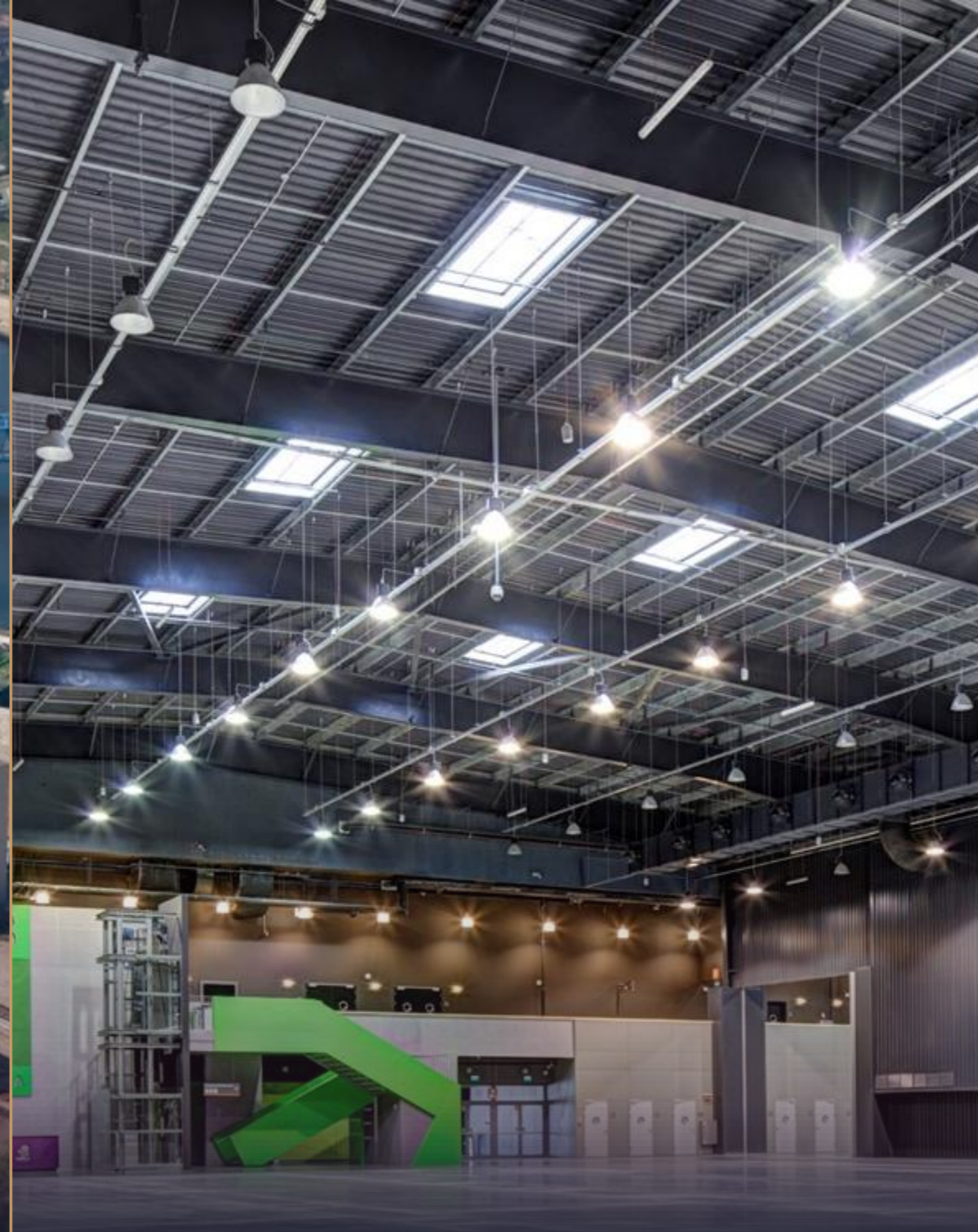
AMBER EXPO Gdansk