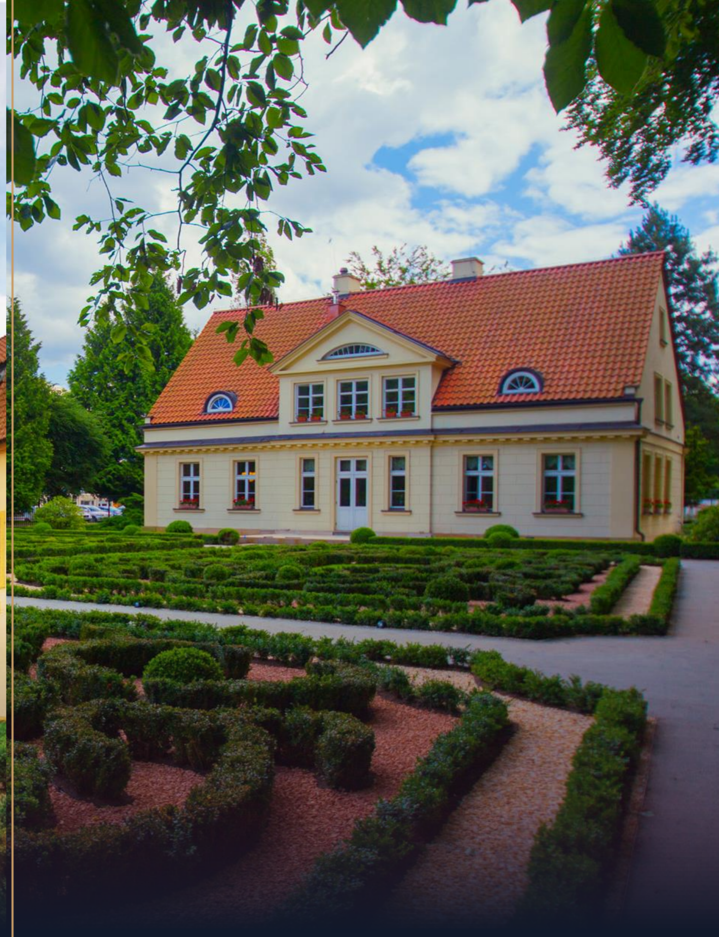
SALTZMAN MANOR Gdańsk