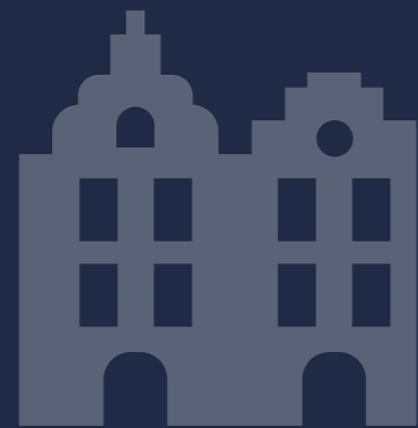
RENOVATION OF HISTORIC BUILDINGS