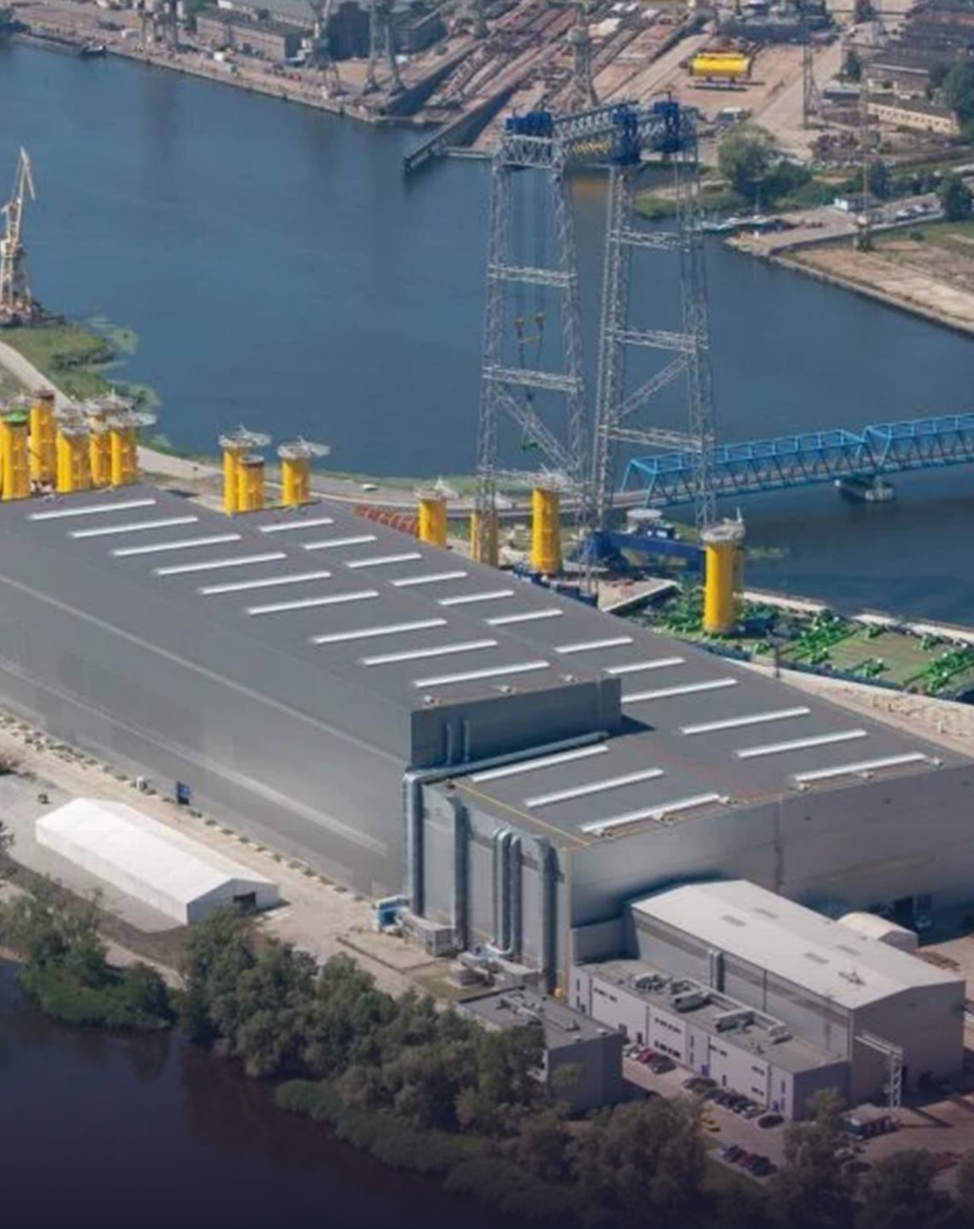
A SERIAL PRODUCTION PLANT Szczecin