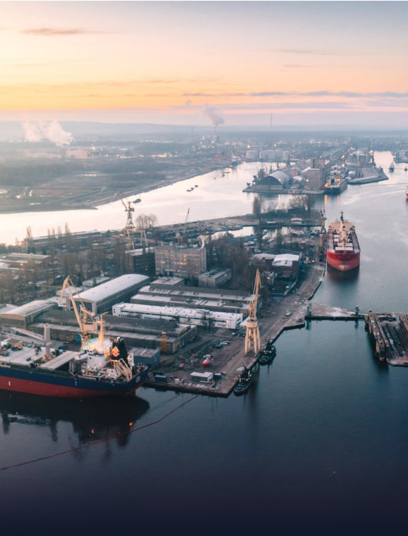
GRYFIA SHIPYARD Szczecin