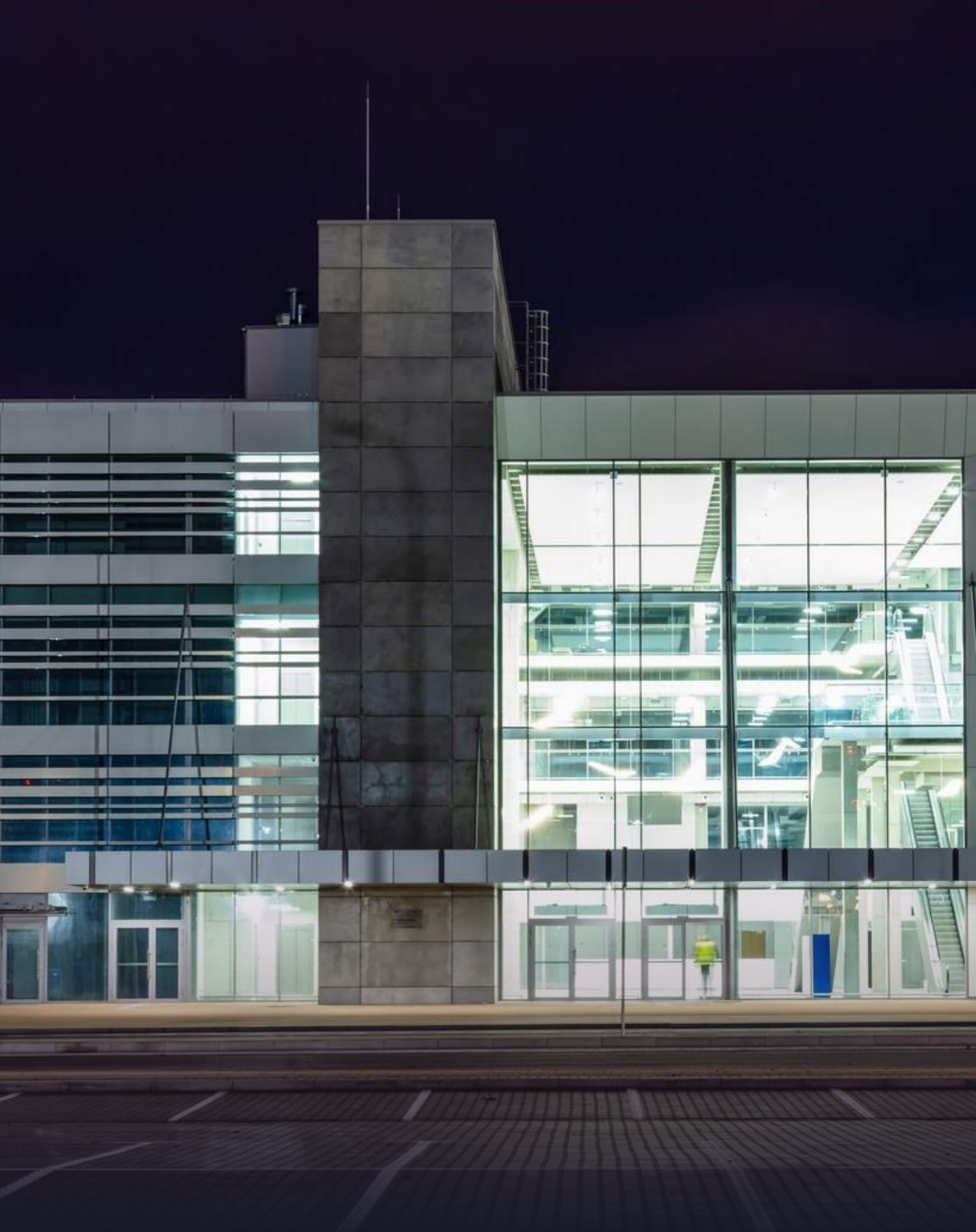
PUBLIC FERRY TERMINAL Gdynia