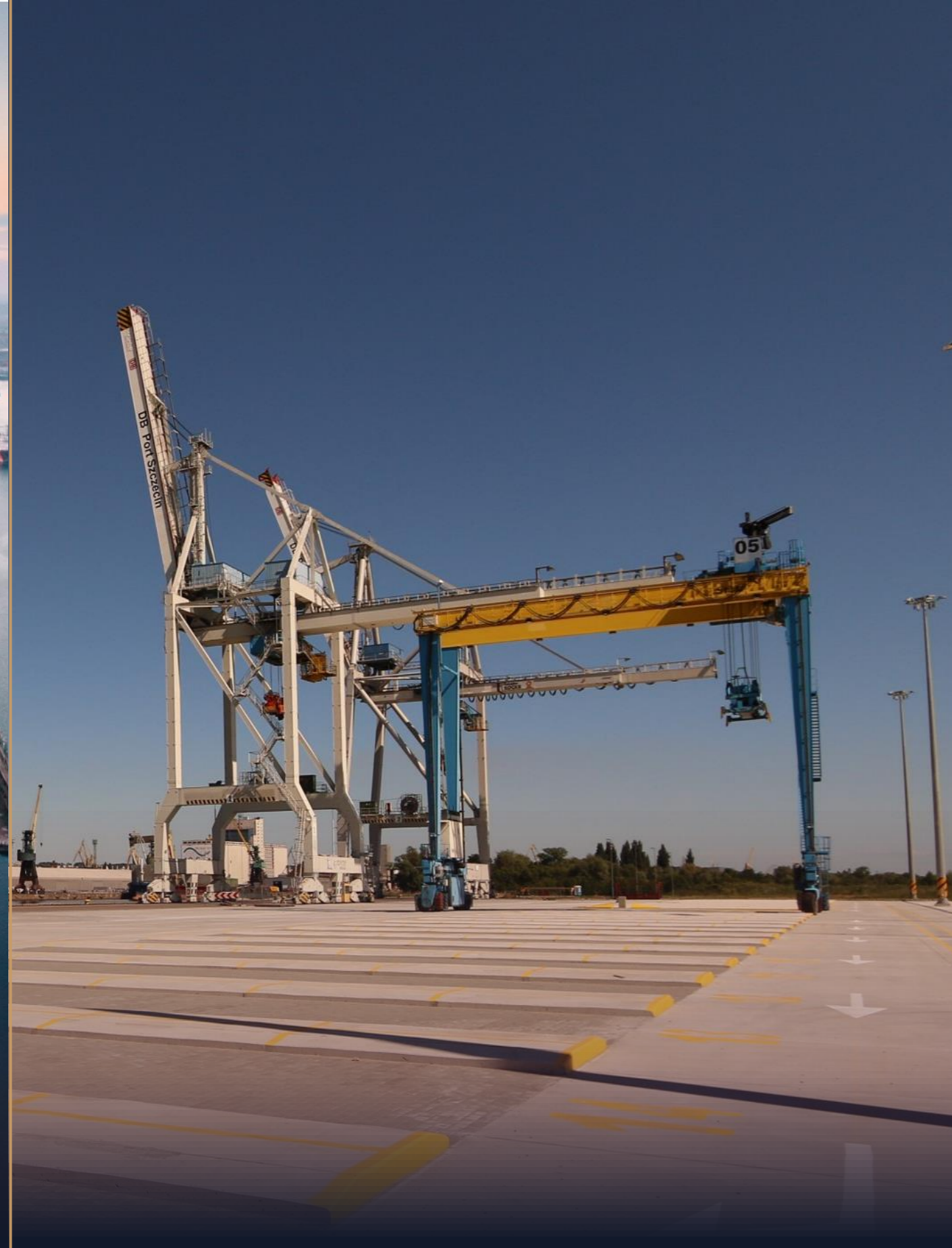
DEUTSCHE BAHN PORT Szczecin