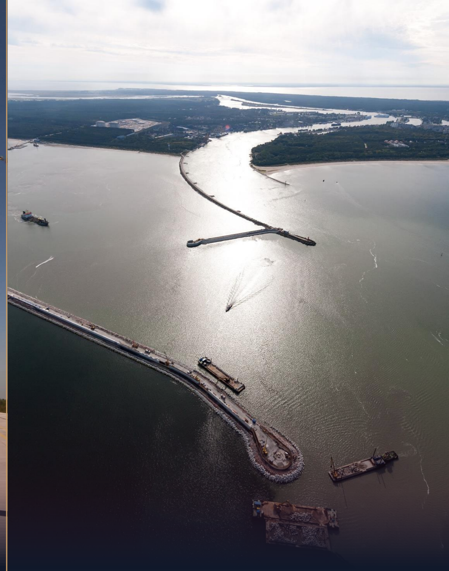
BREAKWATER FOR THE LNG TERMINAL Swinoujscie