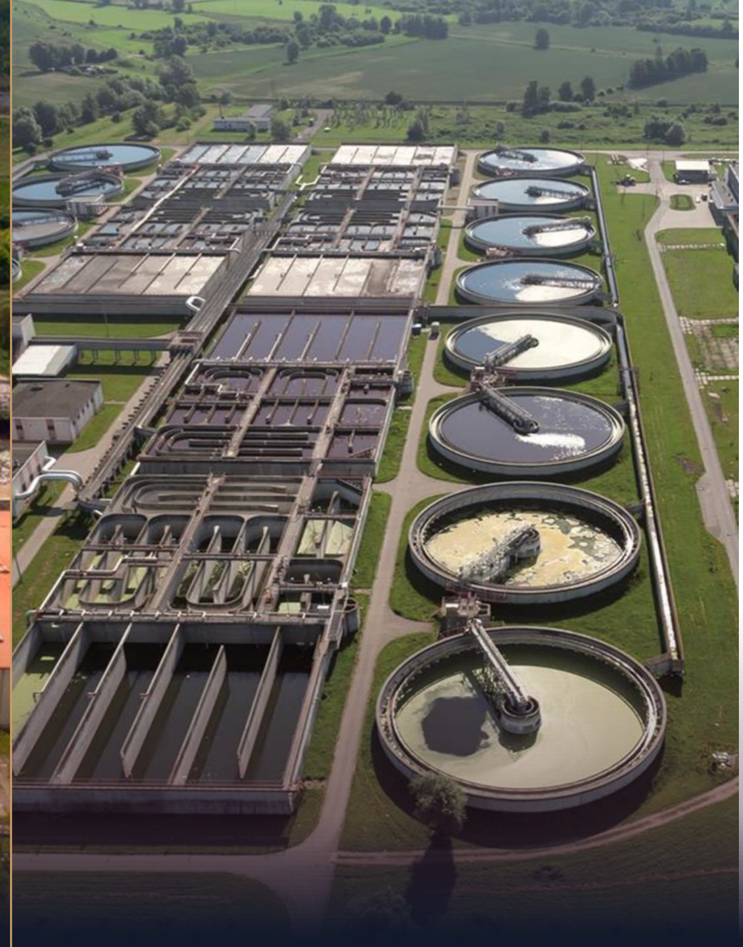
EAST SEWAGE TREATMENT PLANT Gdansk