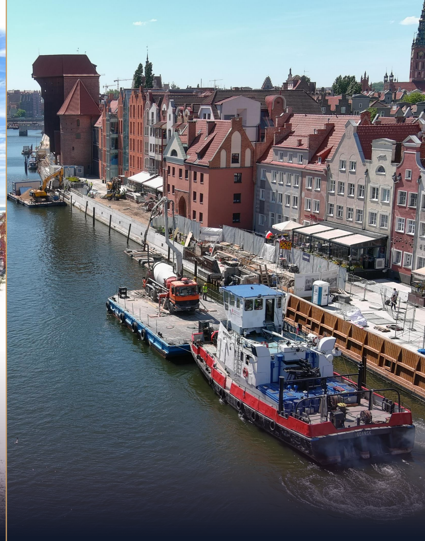
DŁUGIE POBRZEŻE Gdańsk