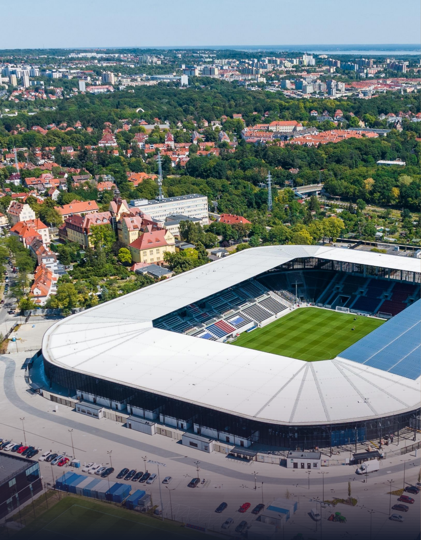
POGON STADIUM Szczecin